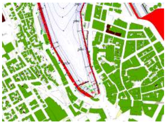
Figure 3. When we got the data into the common map database.

Combining all the data this way proves very useful to the mariner and is something municipalities and ports should keep updated themselves.