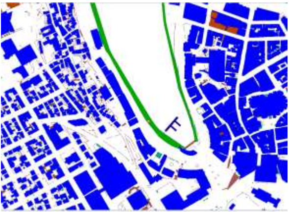
Figure 1. Illustration without port information from common map database. Like it is today.