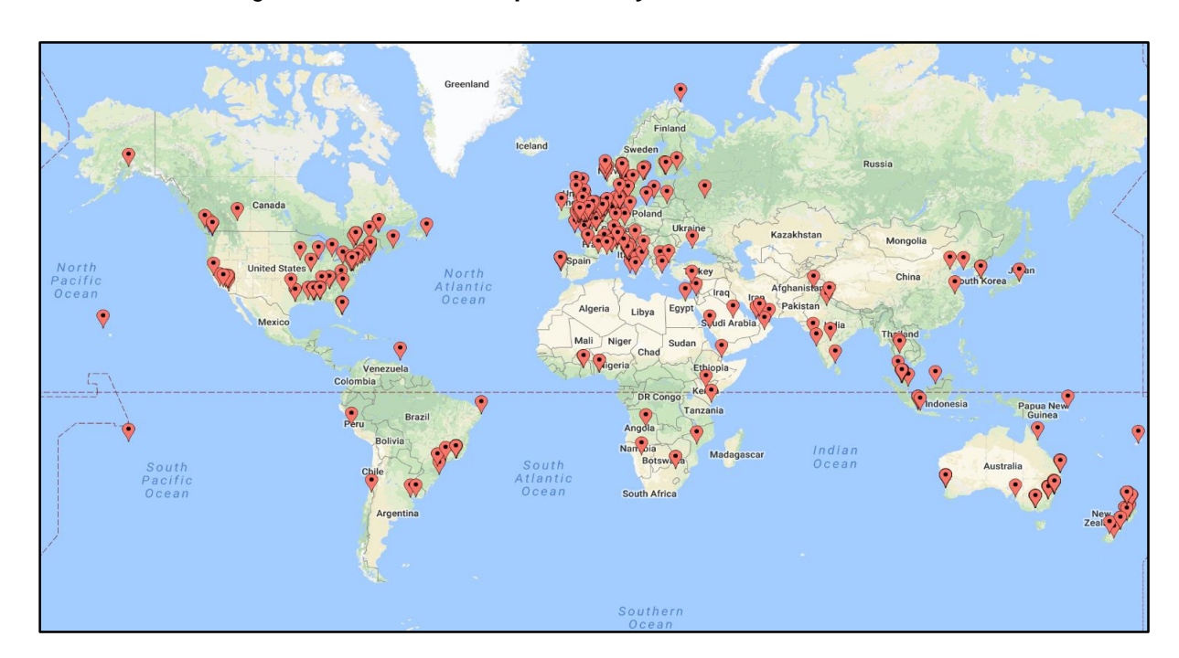
Figure Error! No text of specified style in document..1: Global Distribution of S-44 Questionnaire Respondents.

As part of the review of S-44, members of the international hydrographic community were asked for their views in a questionnaire covering a wide range of topics related to hydrographic survey standards. Designed by the HSPT and administrated by IFHS, the questionnaire was disseminated by IFHS, IHO, FIG and HSPT members from mid-August to the end of November 2017. 500 replies were received, with 114 respondents replying in the last week following Hydro17 conference see Figure Error! No text of specified style in document..2 and Error! Reference source not found. for more detail. Responses were received from all over the world with the highest concentration from Europe and Eastern USA see Figure Error! No text of specified style in document..1for the distribution.