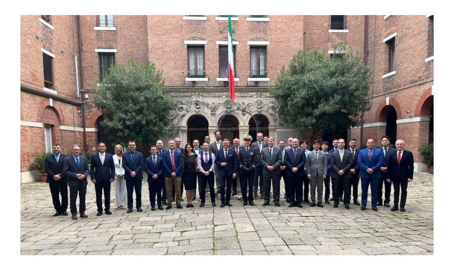
Participants in HCA-19, in-person and VTC