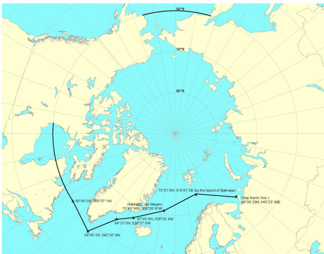
Figure 2 – Maximum extent of Arctic waters application 3