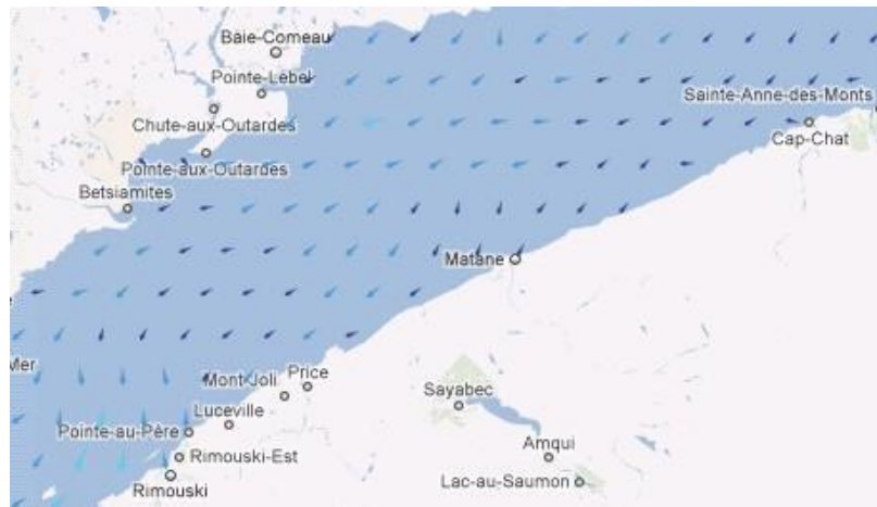
Figure 1 - An Example of a Gridded Coverage of Surface Currents in the St. Lawrence River (High Tide - Reverse Flow)

Surface currents are represented as a gridded coverage. A value representing the orientation and intensity (direction and speed of the current) at each vertex point in a grid coverage is used to describe the current coverage function. An example is illustrated in Figure 1.