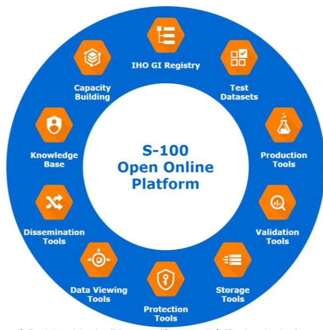
Figure 2 Building blocks Diagram

Building blocks required to achieve the vision and goals of S-1OOP are shown in Table 1 and Figure 1. However, these may be refined with experience, project conditions or requirements from stakeholders. Building blocks are technical resources, resource sharing infrastructure, open source software tools, technical guidelines and reference materials that would allow any organizations to achieve S-100 operational capability quickly and efficiently.