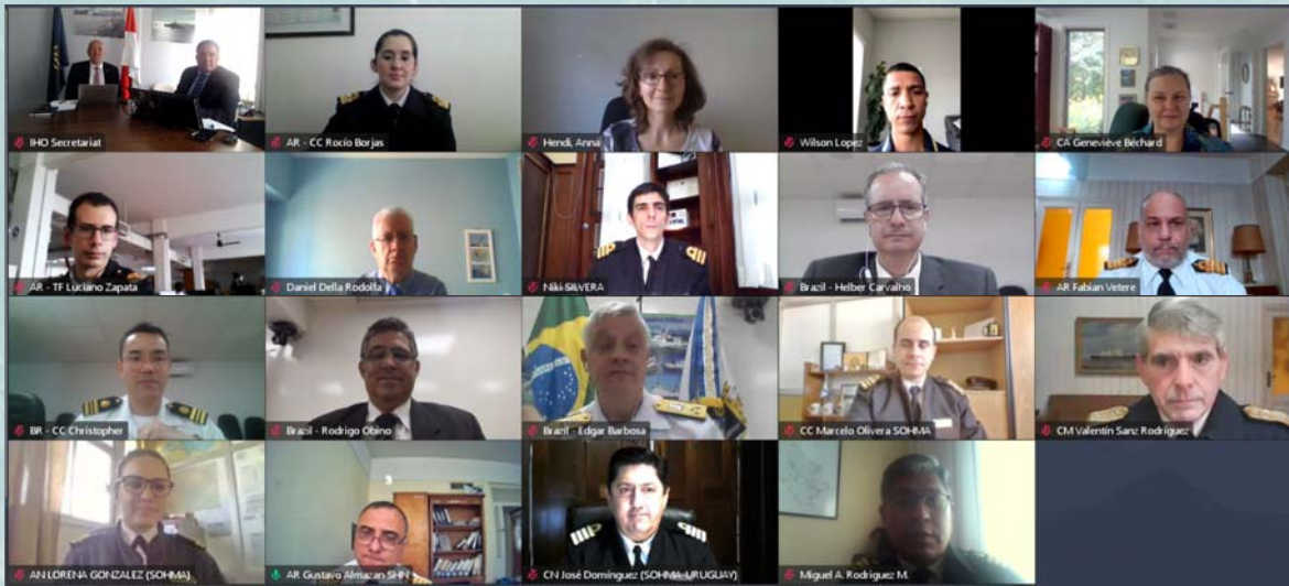
Participants of the SWAtHC15 meeting.

the IHO Centenary celebrations and the recent launch of the new IHO website of the International Hydrographic Review (IHR).