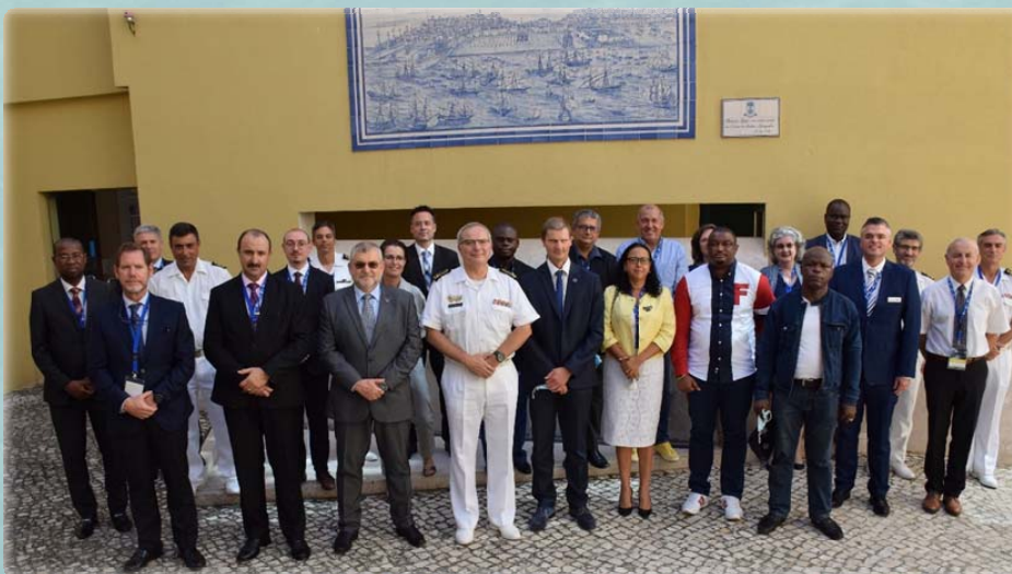
In-person participants of the hybrid 16 th Conference of the EAtHC.