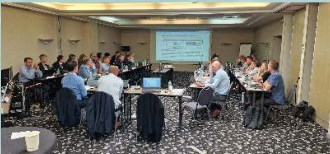
S-101PT10 in session

Several proposals for amending or extending S-101 were submitted to the meeting, for inclusion in S-101 Edition 1.2.0. The meeting agreed that, pending the approved changes and further Sub-Group recommendations being applied, final Project Team endorsement of S-101 Edition 1.2.0 would be achieved at the next S-101PT meeting (September 2023). Significant discussion also took place on the steps required, and possible risks, in achieving operational release of S-101 during 2024 in line with the S-100 Roadmap.