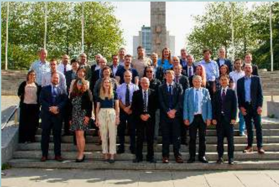
S-101PT10 in-person participants