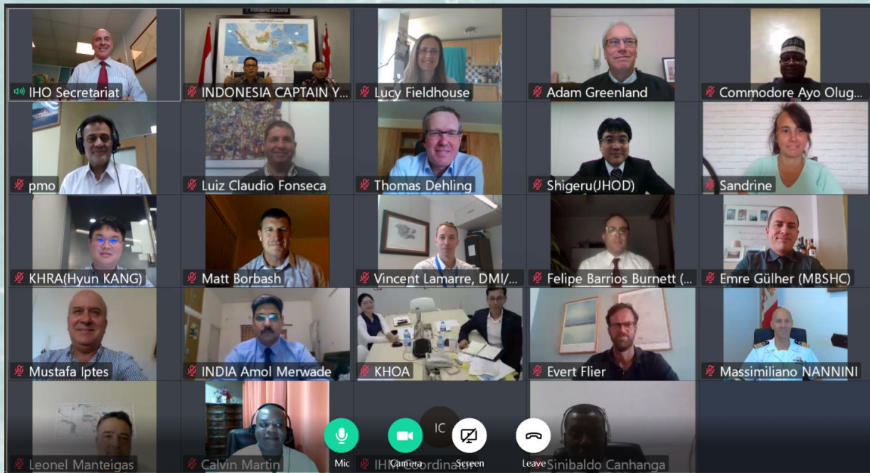
Participants of the 18 th meeting of CBSC

During the meeting, the 2020 CBWP was updated and adjusted, considering the priorities identified by the Sub-Committee and the available and potential additional resources. In addition, the 2021 CB Management Plan and the 2021 CBWP were discussed and approved.