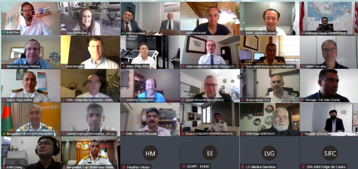
Some participants of the 19 th meeting of CBSC