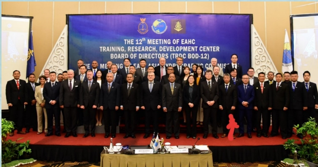
Participants of the 9 th meeting of the Steering Committee of the East Asia Hydrographic Commission (EAHC)

The IHO CSB initiative is also working directly with the Seabed 2030 Project. SB2030 intends to not only accelerate CSB activity around the world, but to also serve as a Trusted Node to help in the setup of data collection and data assembly. A presentation on Seabed 2030 re-enforced this message and the EAHC members were requested to share bathymetry data with Seabed 2030 to complete the GEBCO map. The GEBCO 2022 grid stands at 23.4 % of the world's seafloor mapped.