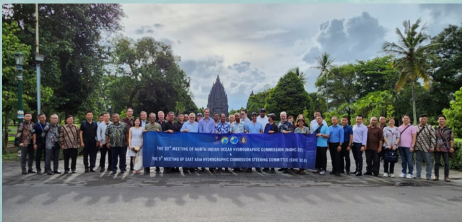
Historic first time joint excursion for NIOHC and EAHC delegates

The meeting confirmed that Indonesia and Thailand will occupy the two Council seats allocated to the EAHC for the period 2023 to 2026. The next EAHC SC meeting will be held in Manado, Indonesia on 14 to 15 February 2024 where at the closure the Chair of EAHC will be formally handed over to Thailand and China will become Vice-Chair.