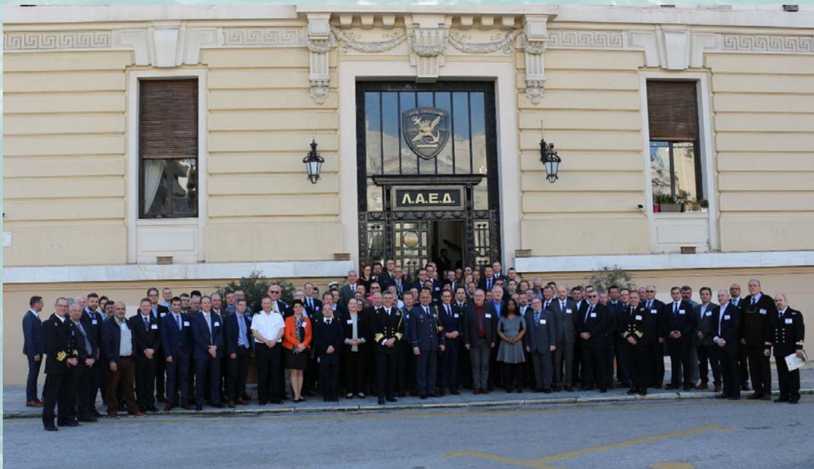
Participants in the NATO Use of Civil Standards Workshop