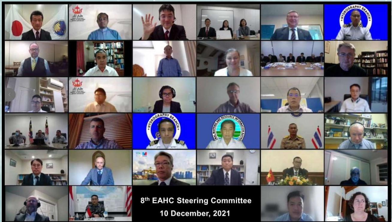
Some participants at EAHC SC-8

Given consideration of the continued COVID-19 pandemic, the next EAHC SC meeting will be held around the Lunar New year in 2023 and the EAHC Conference will be in autumn 2022.