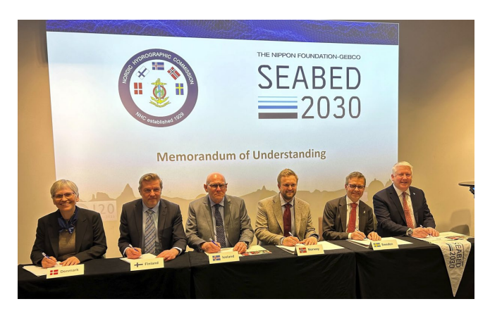
NHC Signing the Seabed 2030 MOU

collaboration was reconfirmed and the NHC appears to be well positioned to successfully implement S-100 products and services in accordance with IHO timelines. Strategic areas of interest included production, distribution, and security.