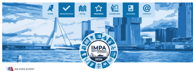
26 th IMPA Congress, WTC Rotterdam

The Congress benefited from a rich programme of speakers from within the IMPA community, as well as from industry, inter-governmental and non-governmental organizations with whom IMPA works and the International Maritime Organization (IMO). The speakers addressed the safety of pilots on duty, environmental regulations and the impact on piloting, a sustainable profession and human capital, environmental sustainability of pilotage as a public service, recent technology, and stakeholders' engagement.