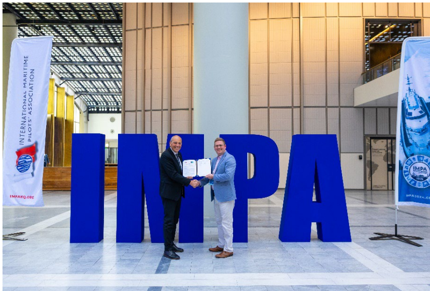
IHO Director and IMPA Secretary General with the recent signed IMPA-IHO Letter of Intent