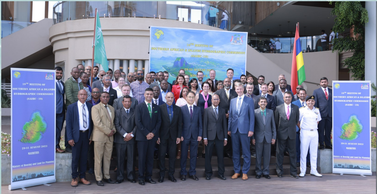
Group photo at the SAIHC19 Meeting