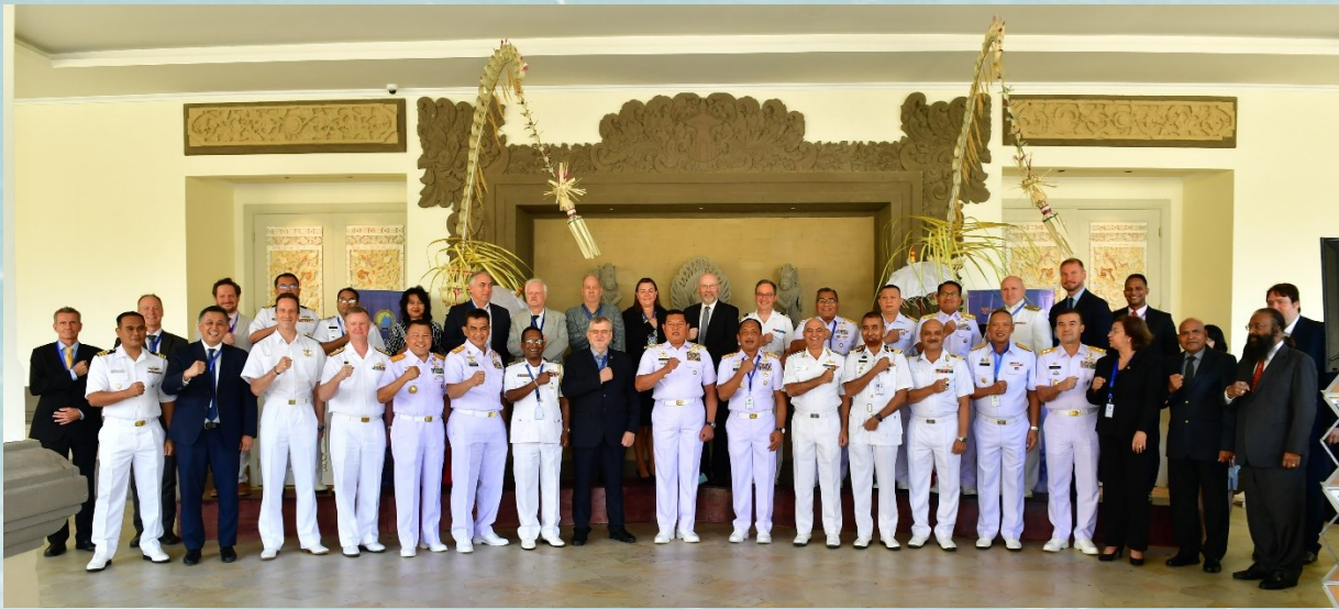
Participants of the NIOHC21 Conference.

The meeting received a number of presentations from industry representatives. These highlighted new technologies and training opportunities available to the region. Industry representatives were keen to emphasise their willingness to engage with the NIOHC and its members to assist with the development of hydrographic and cartographic capabilities within the region.